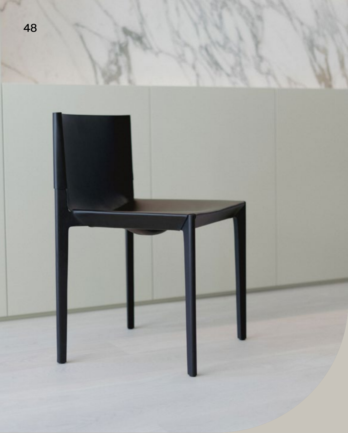
↑ STILT | Chair 332, Cuoio 02 and ebony stained ash base