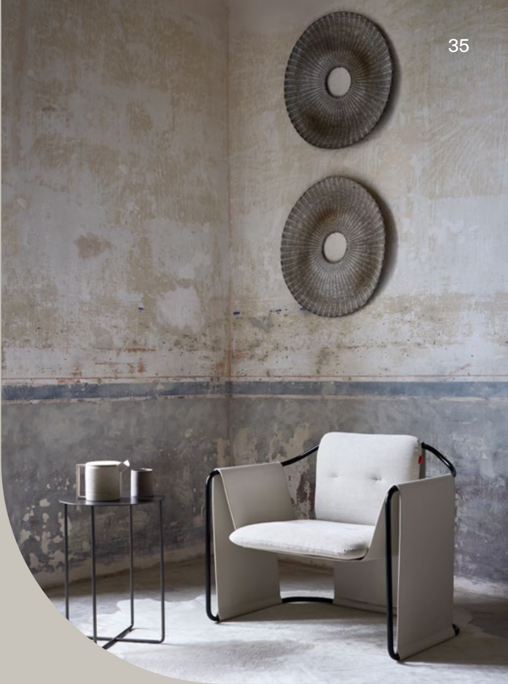
↑ KIMONO | Armchair 010, Cuoio 08, Fabric Galba 121 and laquered metal frame RAL9005 ↑ JUNSEI | Side table T409, laquered metal RAL9005

Kimono is an elegant armchair made up of two elements: a tubular metal structure and a cuoio cover. The Kimono original personality lies in the essential design, in the cover craftsmanship and in the charm of a handmade product. The tubular metal draws the structure, the cuoio dresses it, hiding some parts and showing others: defines the seat and the back, rests on the armrests and falls, stretched on the ground, like the long sleeves of a kimono. Soft cushions guarantee the necessary comfort. It is the great versatility of KIMONO that can be “tailor-made” for different needs and environments, from residential to contract.