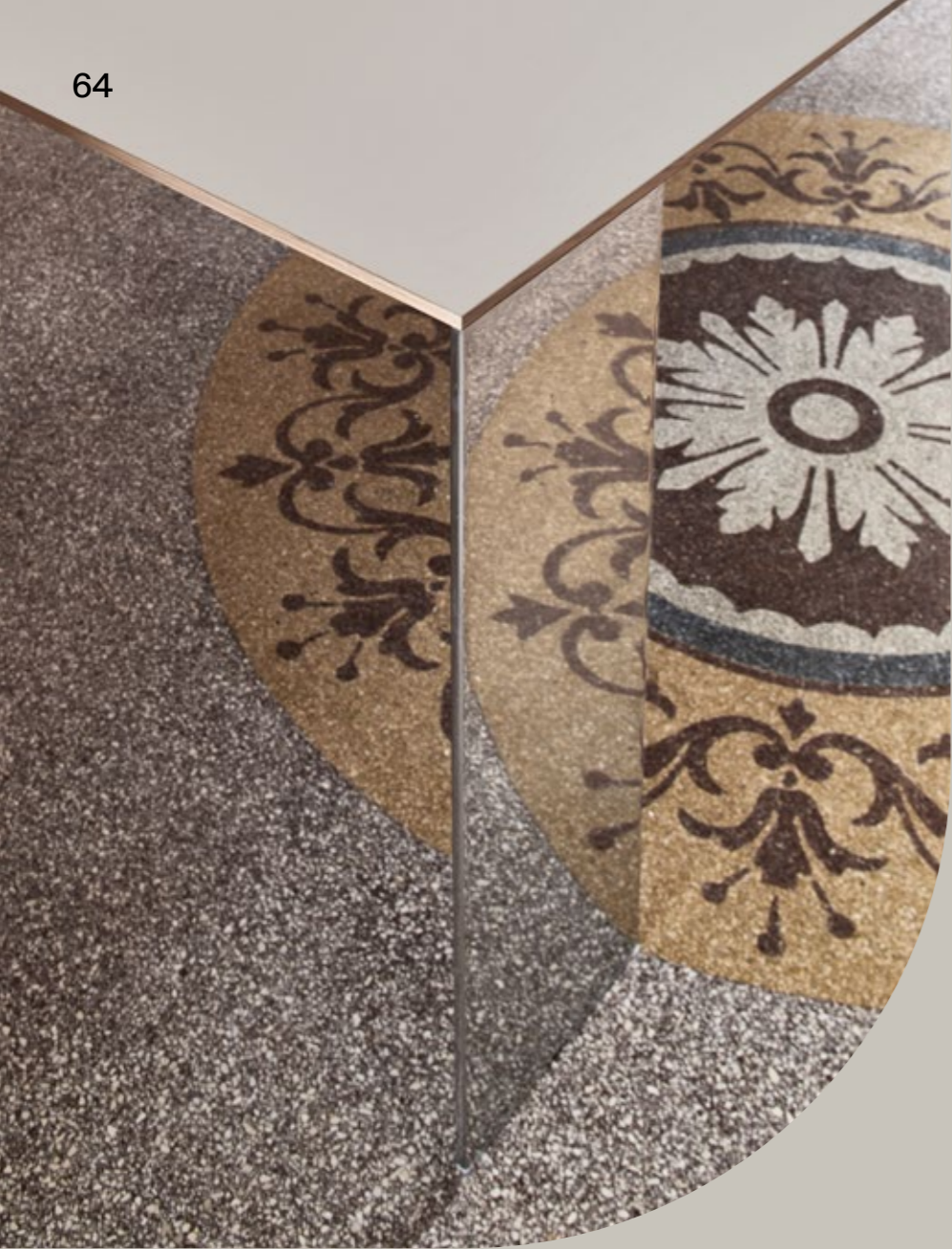
↑ EXILIS | Table T580, glossy steel base and Fenix with natural oak inserts → VIENNA | Chair 010, Cuoio 08 and glossy steel frame → EXILIS | Table T580, glossy steel base and Fenix with natural oak inserts

Fragility and strength, lightness and solidity: these are the boundaries within which the Exilis tables move, with their essential lines, the minimum thicknesses of the slabs that force to the extreme the potentialities of the materials, and at the same time the absolute stability given by the exact balance of power between bases and top. The formal simplicity of the lines that intersect, creating minimal countertops, and the importance of the materials chosen also get in contrast one other: metal plate for the base and marble or wood for the top. Exilis is a collection of tables with a strong personality that fits into any type of living thanks to the ability to assume different aspects from time to time depending on the finishes chosen.