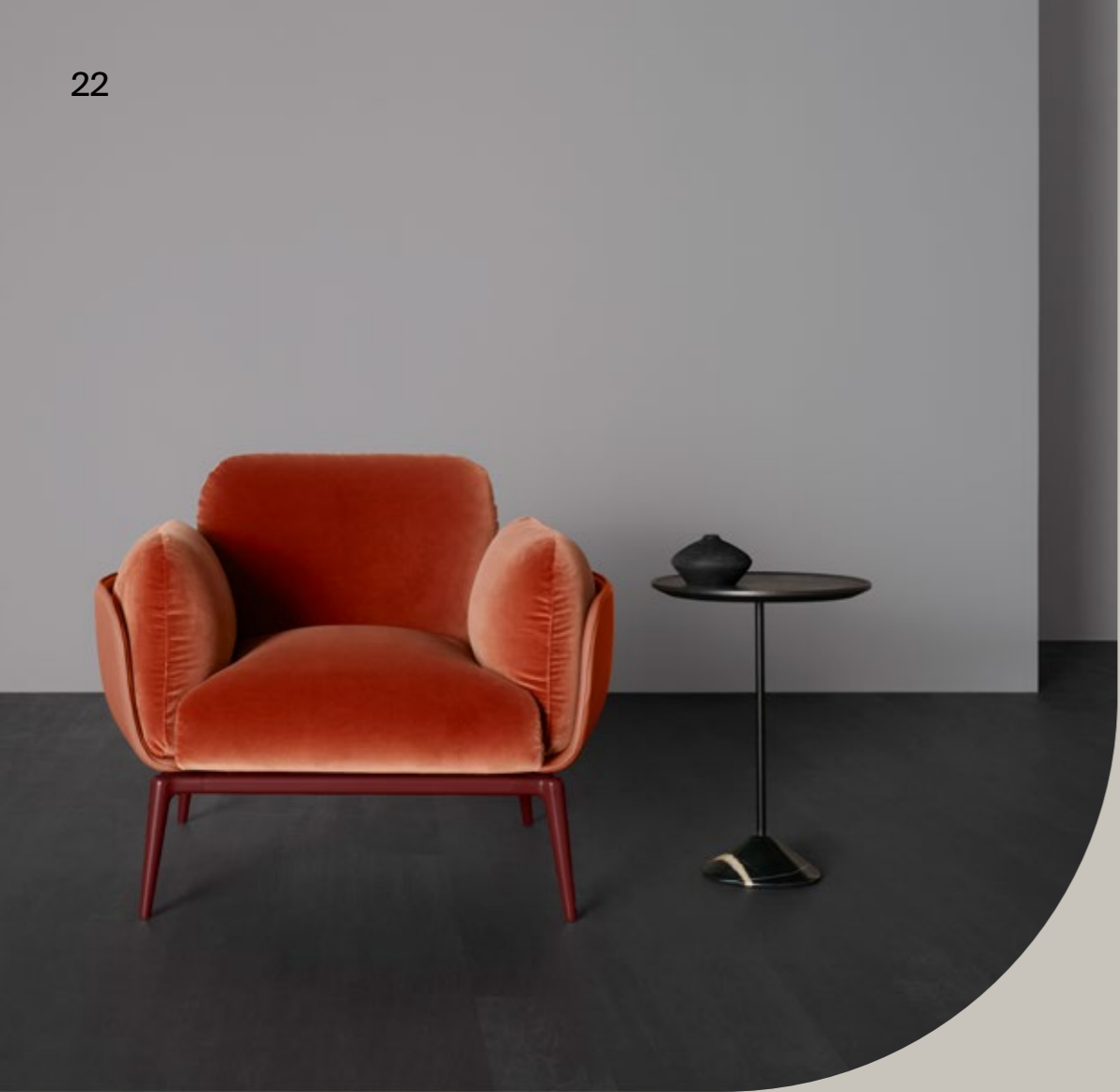
↑ BROOKLYN | Armchair 007, Fabric Domini 1101, Leather Donussa 03 and laquered metal base RAL3005 ↑ HOURGLASS | Side table T512, Marble Saharanoir, Ebony stained ash and laquered metal RAL9005 → BROOKLYN | Sofa 060, Fabric Domini 58, Leather Donussa 01 and laquered metal base RAL7015 → BROOKLYN | Sofa with side table 266, Fabric Domini 58, Leather Donussa 01, laquered metal base RAL7015 and Marble carrara → BROOKLYN | Chaise longue 118+119, Leather Donussa 01 and laquered metal base RAL7015 → QUATTROPIETRE | Coffee table T601, Marble Carrara, Glass top with sanded band and wood laquered base RAL7047 → JUNSEI | Side table T409+410, Metal laquered RAL7022