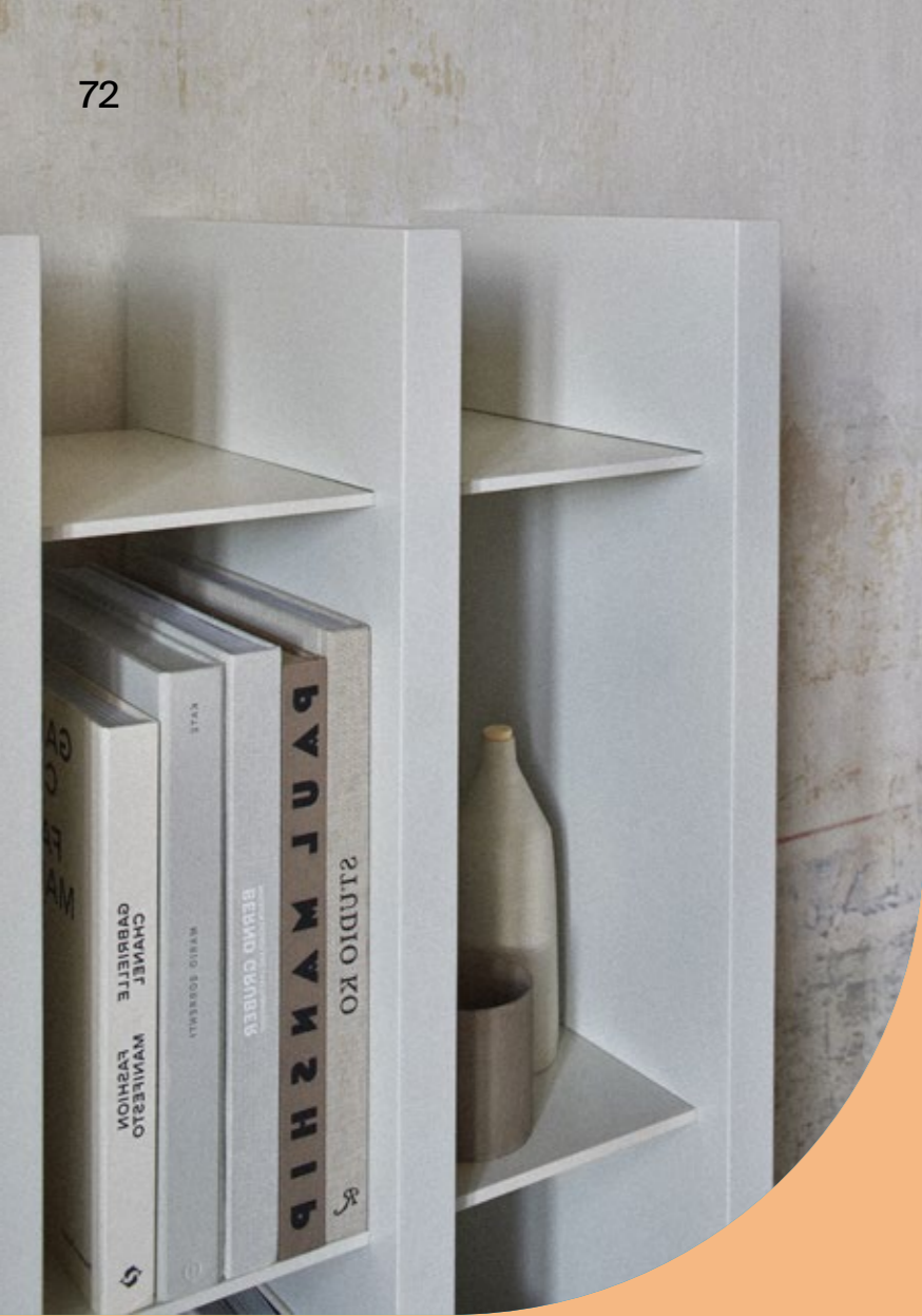
↑ PARERE | Bookcase, laquered wood and metal RAL9002