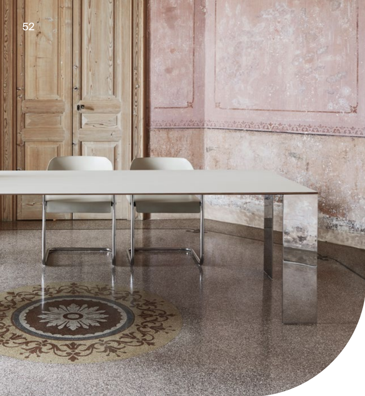
↑ VIENNA | Chair 010, Cuoio 08 and glossy steel frame